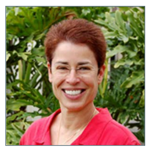
Karen Berkman Center for Autism and Related Disabilities