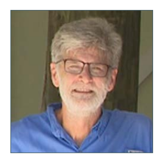
Bradlee Shanks Art & Art History