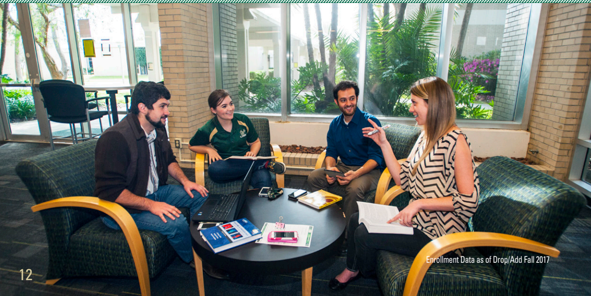
Enrollment Data as of Drop/Add Fall 2017