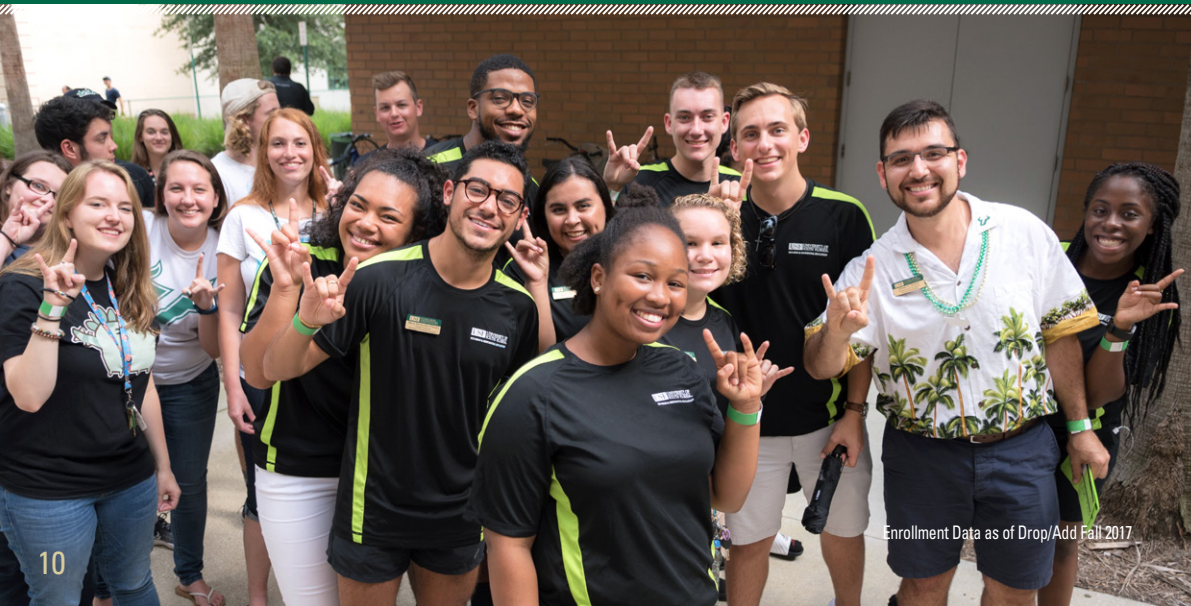
Enrollment Data as of Drop/Add Fall 2017