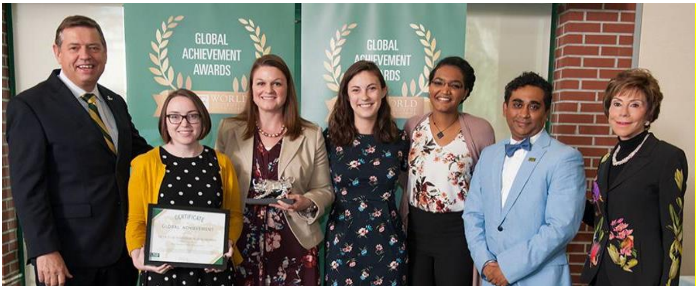
The ONS Team were recognized in 2018 at the USF Global Achievement Awards.

The Rangel Graduate Fellowship is a program that aims to attract and prepare outstanding young people for careers in the Foreign Service of the U.S. Department of State in which they can help formulate, represent and implement U.S. foreign policy. The Rangel Program selects outstanding Rangel Fellows annually in a highly competitive nationwide process and supports them through two years of graduate study, internships, mentoring, and professional development activities. This program encourages the application of members of minority groups historically underrepresented in the Foreign Service, women, and those with financial need.