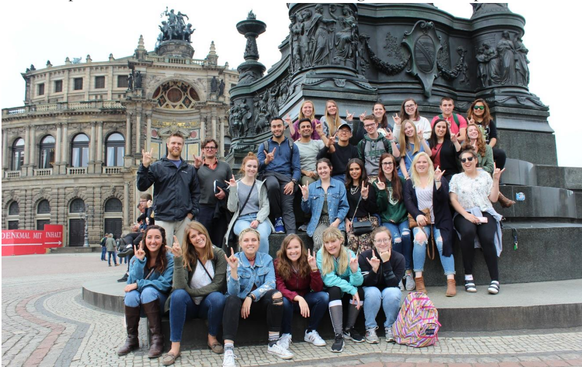
Honors College students pose while studying abroad in Germany in 2018.

Students participating in our travel abroad programs have been generously funded through travel scholarships that pay for airfare and some program cost. Our Germany International Experience course received a $25,000 grant from the Max Kade foundation to help fund 25 students with $1,000 travel grants. Additional generous travel scholarships were provided through the Genshaft/Greenbaum International Honors Study Abroad Scholarship Fund, the McCorkle Study Abroad Scholarship, and the Terrell and Neva Sessums Regents Scholarship.