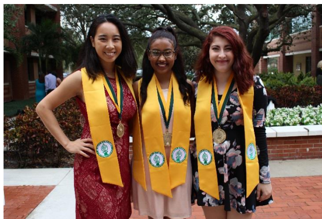
In 2017 the College implemented the Dean's Circle of Merit to recognize students who went above and beyond in their leadership and service. Pictured here are three of four inaugural members at Honors College Commencement.