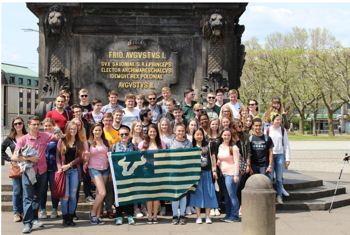
Honors College students pose while studying abroad in Germany in 2017.

Students participating in our travel abroad programs have been generously funded through travel scholarships that pay for airfare and some program cost. Our Germany International Experience course received a $25,000 grant from the Max Kade foundation to help fund 25 students with $1,000 travel grants. Additional generous travel scholarships were provided through the Genshaft/Greenbaum International Honors Study Abroad Scholarship Fund, the McCorkle Study Abroad Scholarship, and the Terrell and Neva Sessums Regents Scholarship.