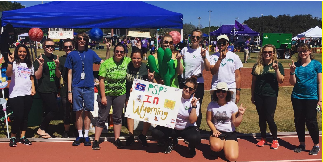
Provost's Scholars bring together a team each year to raise money for the USF Relay For Life event.

PSP students have continued to remain involved in several trips around the world, internships and research experiences to further their goals here at USF. Students have also attended educational dinners with the Provost and raised more than $2,000 for the annual "Relay for Life" event benefiting the American Cancer Society.