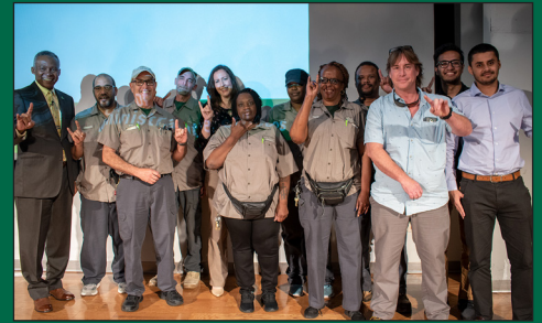
Nominees from Session 1 of the Town Hall.