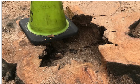
The stump of a tree that has been removed, showing that the tree was hollow and rotted.

Planning Department has started removing and replacing trees showing the most decay.