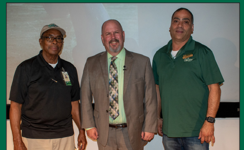
Nominees from Session 3 of the Town Hall.

Thank you all for helping to create a culture of excellence!