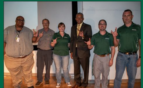
Nominees from Session 2 of the Town Hall.