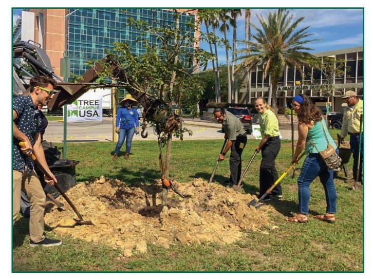
Students assisted in planting three Golden Trumpet Trees in front of the John & Grace Allen Building.

The project successfully introduced 72 colorful trees around the campus. It is the hope of all involved that each spring students will be greeted with flowers and every summer students will benefit from the shady sidewalks.