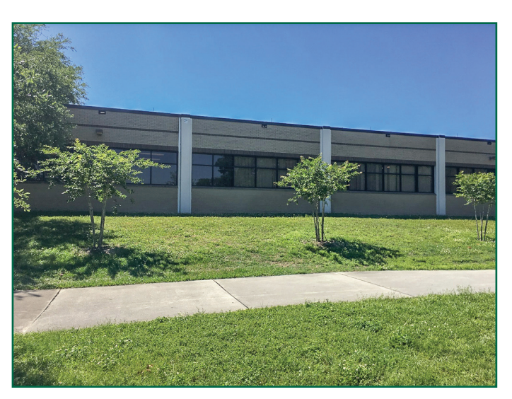
New trees planted alongside the Student Health Services building as part of the "Planting Trees to Reduce Cooling Loads on Campus" project.